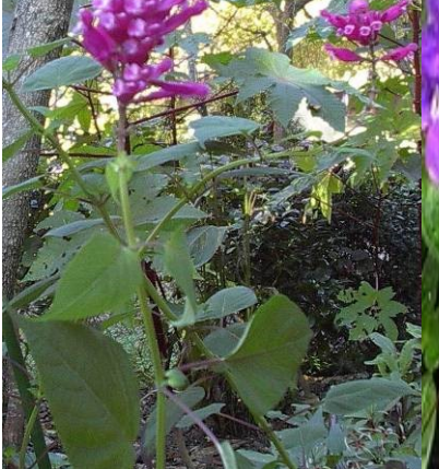
"Salvia" Rose Leaf Sage