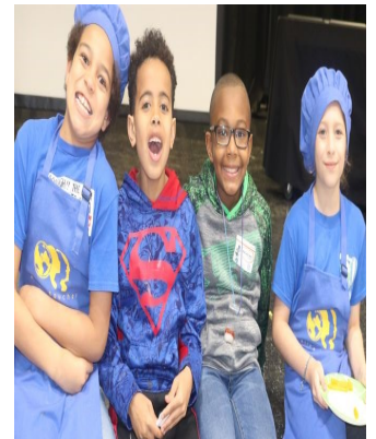
Future Master Gardeners