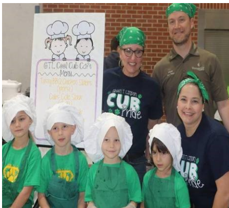
GREEN T LINDON TEAM