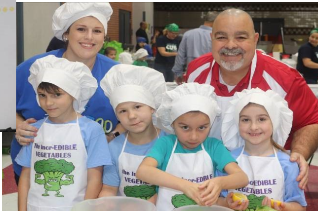
RIDGE ELEMENTARY TEAM