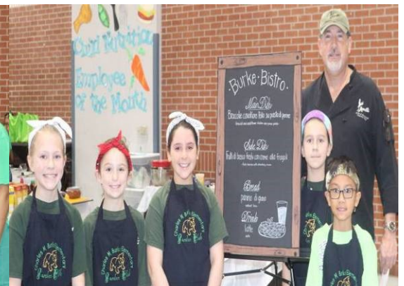
BURKE ELEMENTARY TEAM