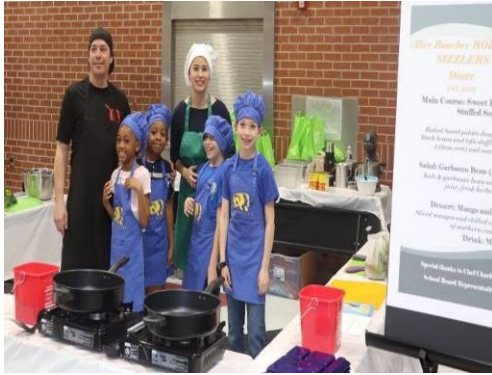
ALICE BOUCHER ELEMENTARY TEAM

The goal of the Lafayette Parish School Garden Initiative On Cuisine du Jardin Cook-Off is to