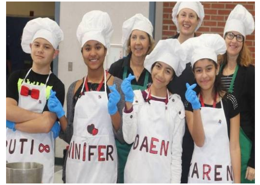
JUDICE MIDDLE SCHOOL TEAM