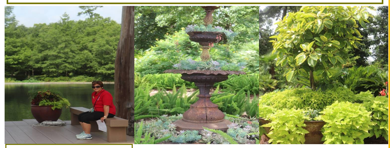
COOL SPOT TO REST NEXT TO THE LAKE

An easy drive to Orange Texas and we were at the Garden. They are divided into areas, such as Hanging and Sculpture gardens, Epiphyte House, and different garden rooms. The Star & Crescent Moon Café has a interesting menu with awesome food. We had a great time.