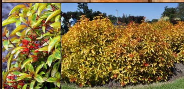
LIME SIZZLE FIREBUSH-5' SHRUB YELLOW/GREEN COMBO RED AND ORANGE BLOOMS ALSO A 2017 MASTER GARDENER CHOICE AWARD WINNER