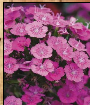
JOLT SERIES DIANTHUS