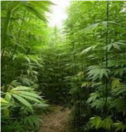
Cannabis sativa : Hemp