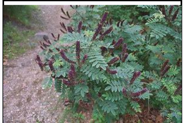
Amorpha fruticosa-Indigo bush, False Indigo