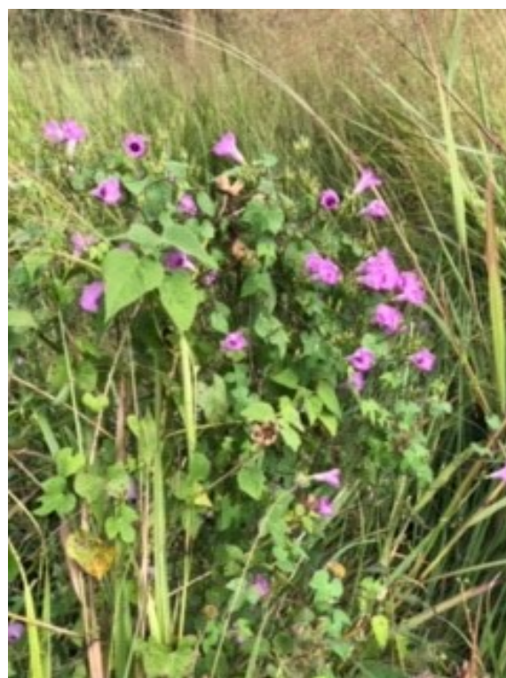
PURPLE MORNING GLORY AMMONG THE GRASS