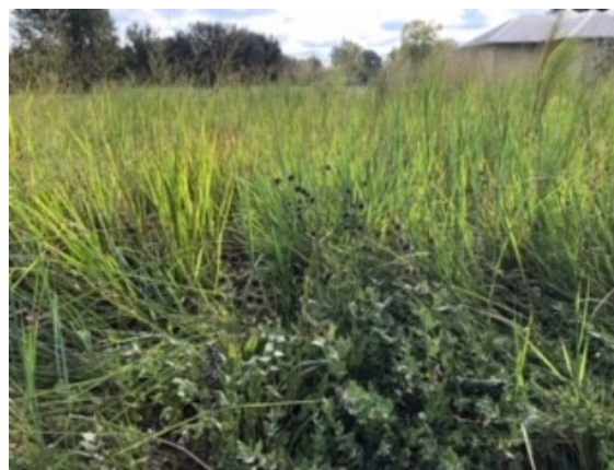
TALL BLUE STEM GRASSES