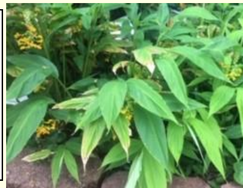
Globia Dancing Girl Ginger Compact plant Shade