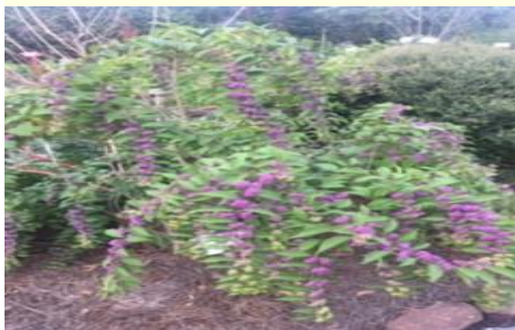
Callicarpa dichotoma Chinese Beautyberry Shrub, sun/part shade Attracts birds