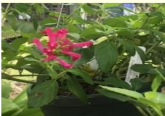
Scutellaria suffrutescens Red Skullcap Sun/part shade Hummingbird magnet