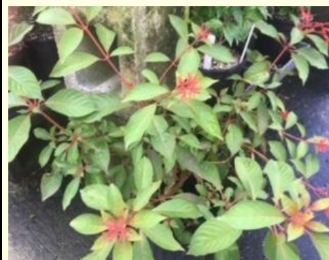
Firebush Heat tolerant Humming birds!

Newspaper Garden Hats Garden Wind Chimes Mini Flower Gardens