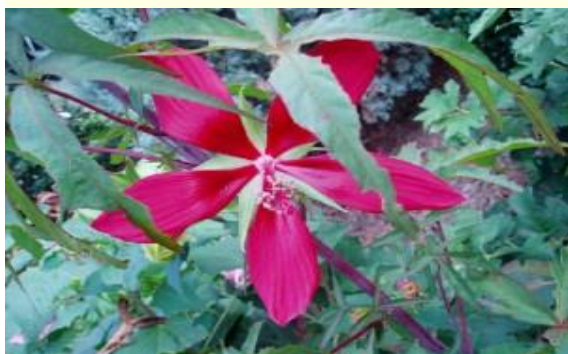
Hibiscus coccineus Texas Star Hibiscus Likes to be damp Butterflies and Hummingbirds

Across from Blackham Coliseum on Coliseum Road