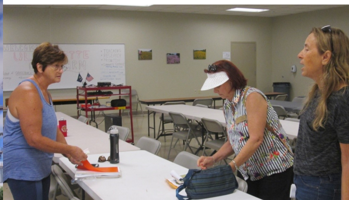
Committee meeting followed the general meeting at Cade