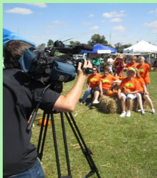
Plant Fest 2015